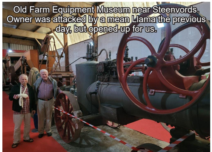
Old Farm Equipment Museum near Steenvords. Owner was attacked by a mean Llama the previous day, but opened up for us.