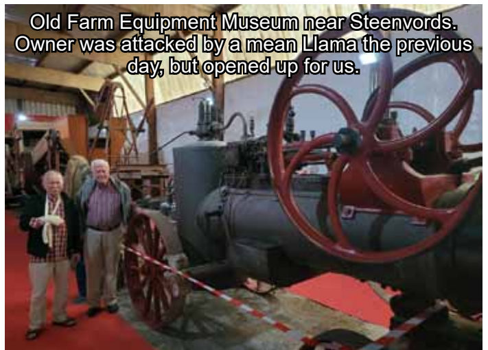
Old Farm Equipment Museum near Steenvords. Owner was attacked by a mean Llama the previous day, but opened up for us.