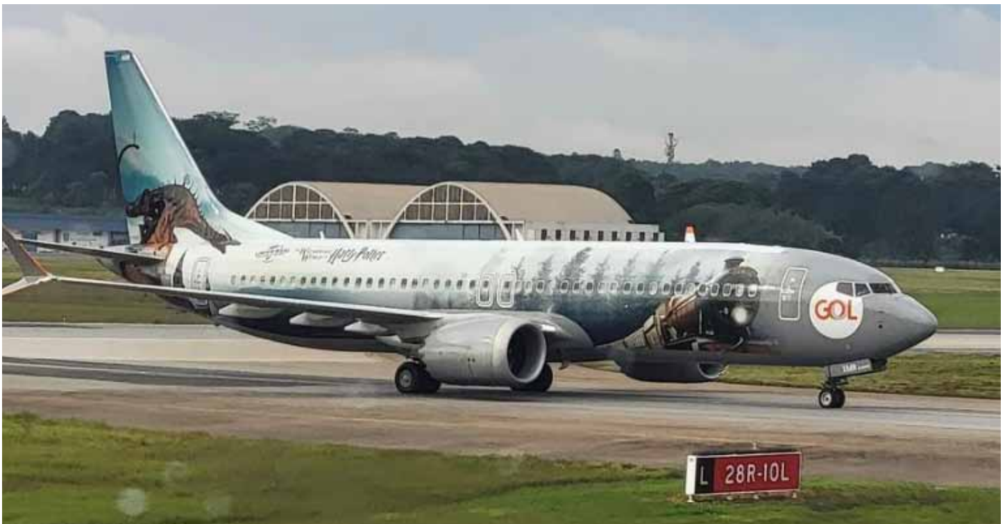
FROM CHRIST STOKES —Saw this cool Harry Potter 737 paint job this morning when we landed in São Paulo, Brazil. Amazing paint job! Read more about this at https://avgeekery.com/harry-potter-themed-737-max-8/ January 2023—page 4