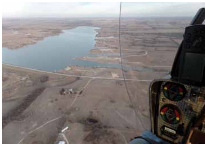
Lake Wilmont is a prized recreation and camping area, It is also the water supply for Winfield, Kansas. I did not see any campers or boaters; most of the lake was frozen over.