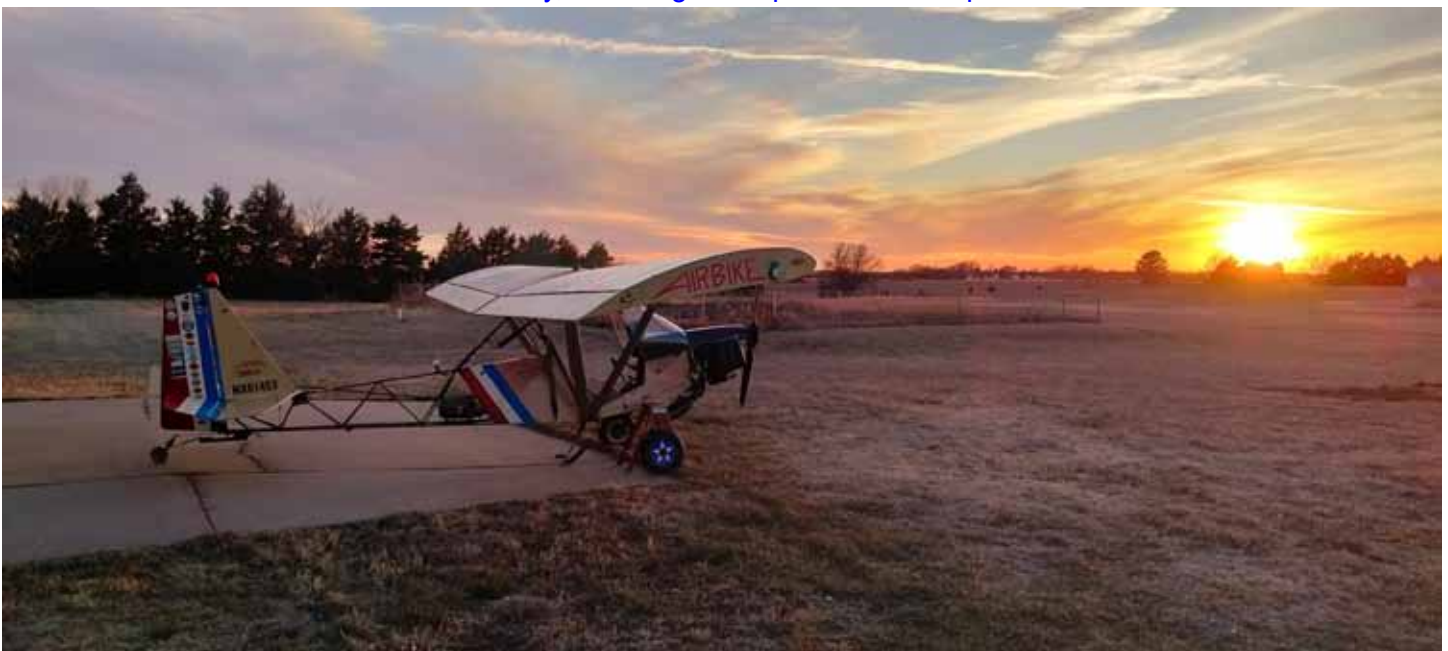
Beautiful sunset during the waning minutes of daylight. I used the remaining time to refuel. Ten minutes later it was really dark.