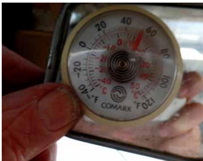
Temp. hovered around 55 degrees. Very close to my minimum acceptable level.