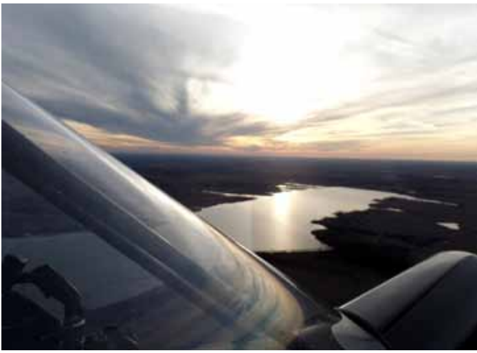
The return flight into the sun provided an interesting reflection on the lake. I flew at 1000' AGL.