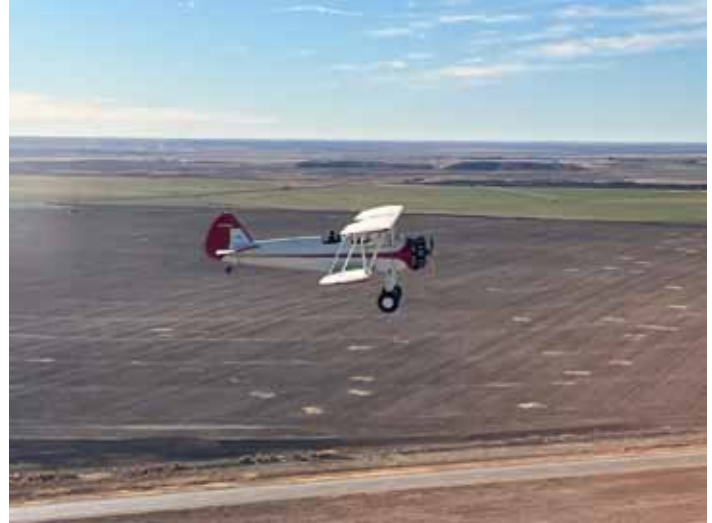
FROM TODD CRIST —Friday Nov 25 was just warm enough to go for a Stearman ride! (I don't think it takes too much arm twisting to get Todd and Amber to go flying!)