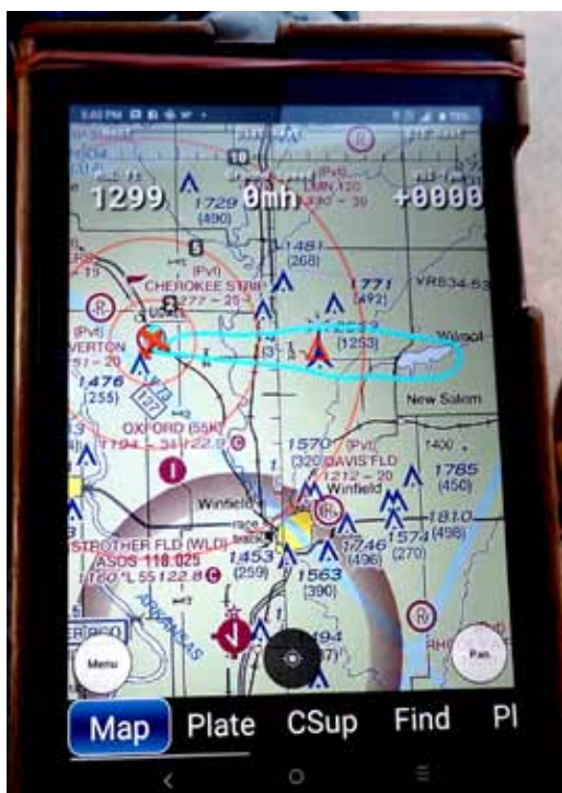
My flight was from from Cherokee Strip (18KS) around Lake Wilmont and return. Took off shortly after 4:00 and returned at 5:00.