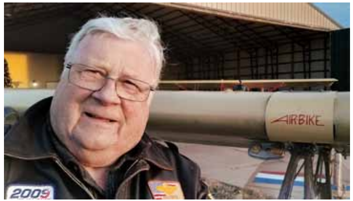
Photo just proves that I did land after that flight. (oh my gosh, where did all that white hair come from?)