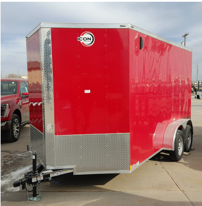
EAA 377 NEW TRAILER!