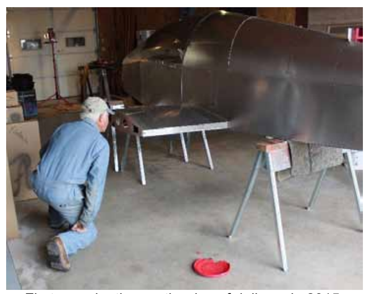
First examination on the day of delivery in 2015.

The museum took possession and title of the aircraft with the understanding that the jet will not be flown again.