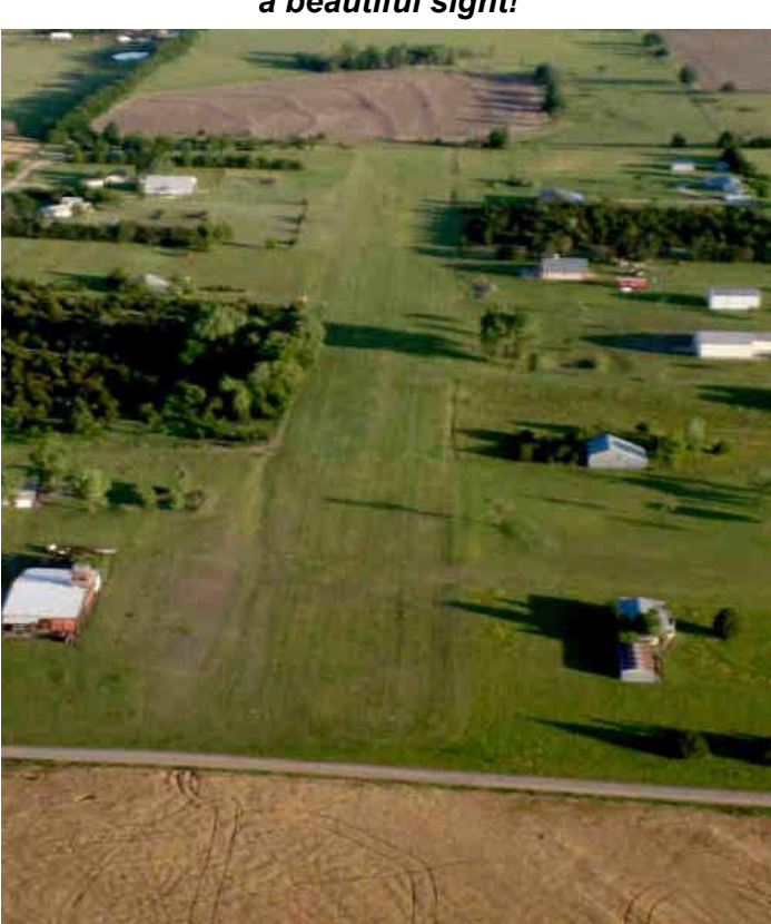
Cherokee Strip (18KS) runway near Udall, KS