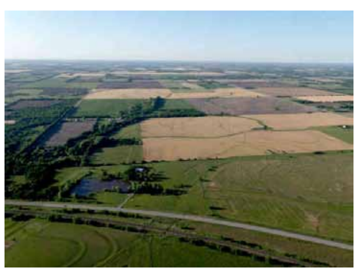
I just can't seem to get enough of the beautiful Kansas panoramic view at 1000' AGL.