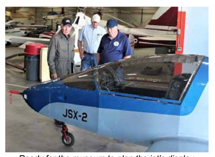
Ready for the museum to plan the jet's display.