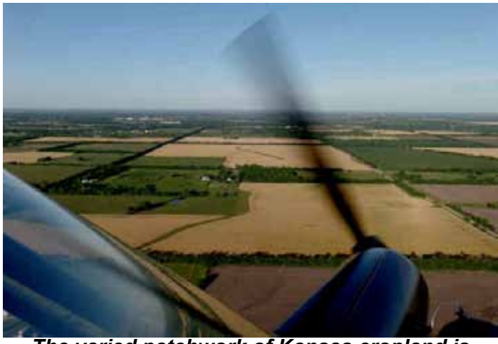
The varied patchwork of Kansas cropland is best viewed in the Springtime.