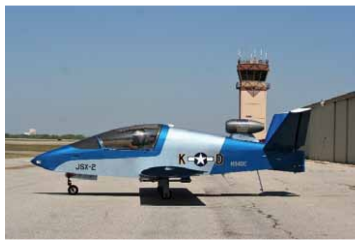
The finished project at Woodring Regional Airport.