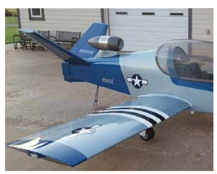
Pneumatic tail stand for parking without the pilot since the plane is tail heavy with the rear engine if the pilot is not seated.