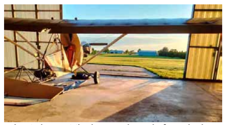
Last view out the hangar doors before closing them. When building this plane in 1998, I never imagined how much it would affect my life---it continues being a fantastic experience! June 2022—page 8