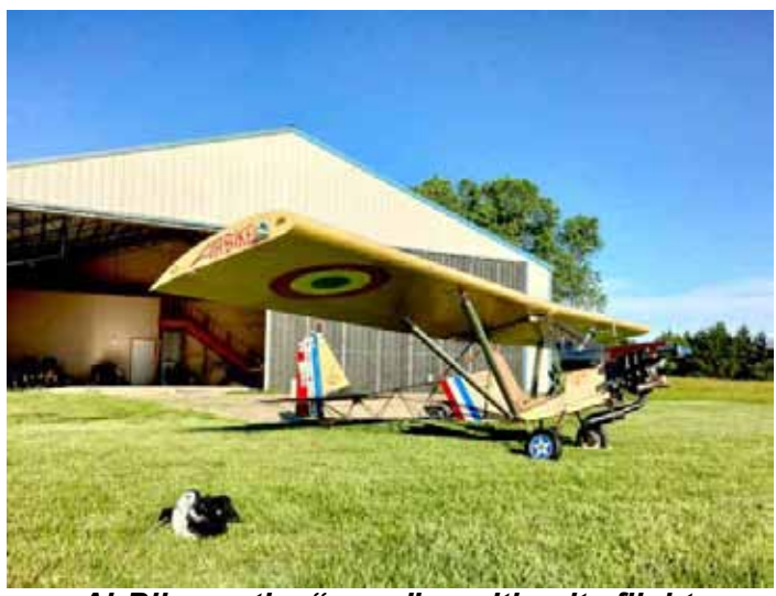
AirBike on the "ramp" awaiting its flight.

The next week's prediction is for five days of rain. Go fly whenever you can! Enjoy the photos, imagine the aroma, engine noise, and vibration. Both were apparent although at different altitudes on the AirBike or the Honda 650 motorcycle. Life is good!