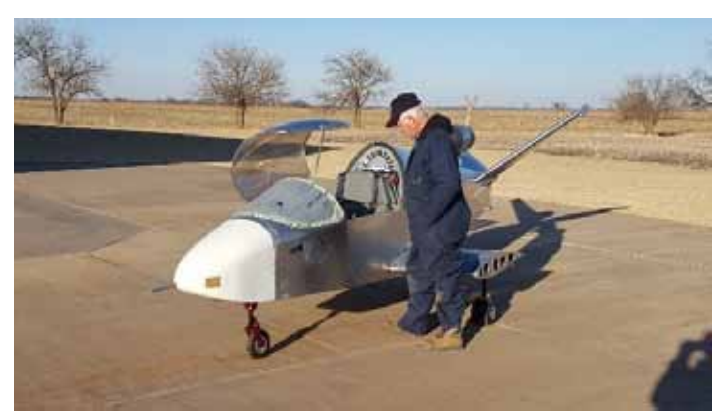
First taxi test was on the driveway at home before installation of the wings.