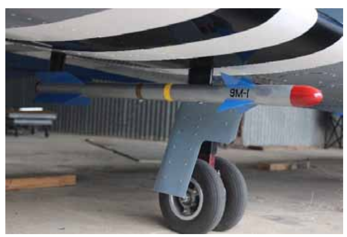
Aim-9 missiles hand crafted to scale and attached to the underside of the wings.

The addition of the auto pilot made flying the jet a lot less labor intensive. The aircraft is extremely responsive so that any little control surface input gave relatively large changes in attitude and having the auto pilot allowed for a little more relaxed flight.