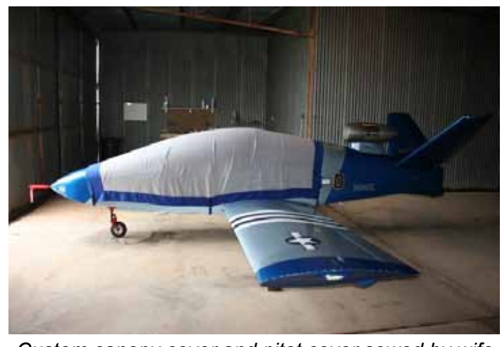
Custom canopy cover and pitot cover sewed by wife Dee Ann.