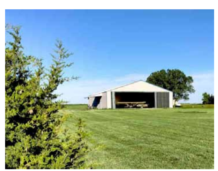
This is the "path" I mowed on which the AirBike will taxi to the runway.