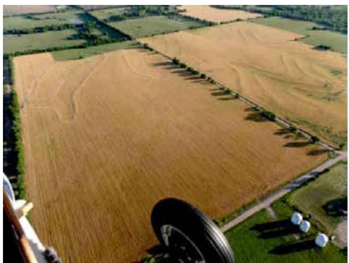
Wheat crops are thick and weed free, a beautiful sight!