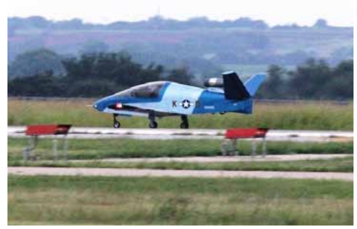
First Flight takeoff roll was late one August evening in 2018.