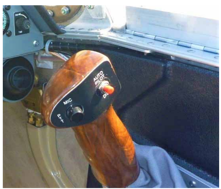
Solid walnut control stick.