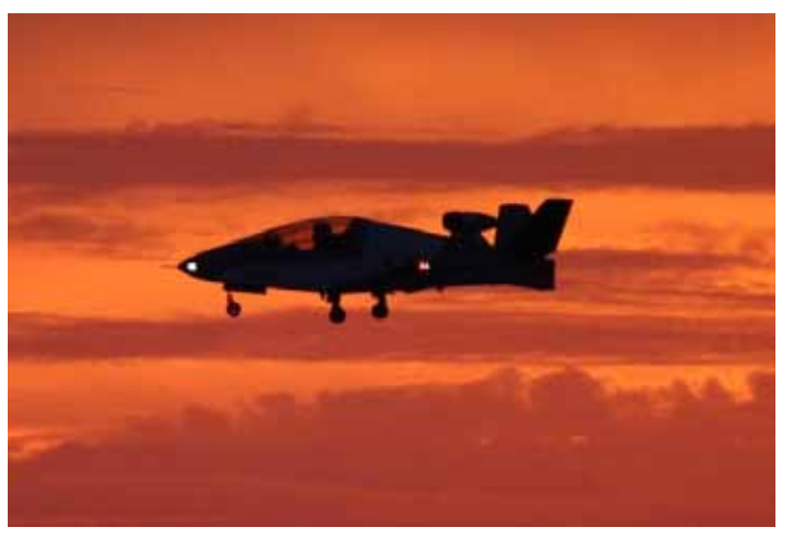
By the time the maiden flight was finished, the sky was lit up by a beautiful sunset. First flight was with gear down for safety consideration.

A few of the personalized additions to the aircraft included Aim-9 missiles, a handcrafted solid walnut control stick, self-designed pneumatic tail stand, hand crafted trim wheel, heated seat, hand crafted air vents and wing fairings, forced air toe heater, oxygen system, exterior charging port, and a Tru-Trak auto pilot.