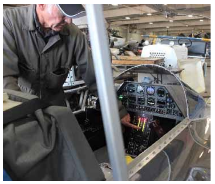
Illustrating the engine monitor.