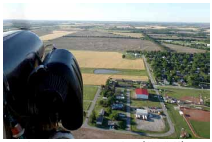
Passing the western edge of Udall, KS.