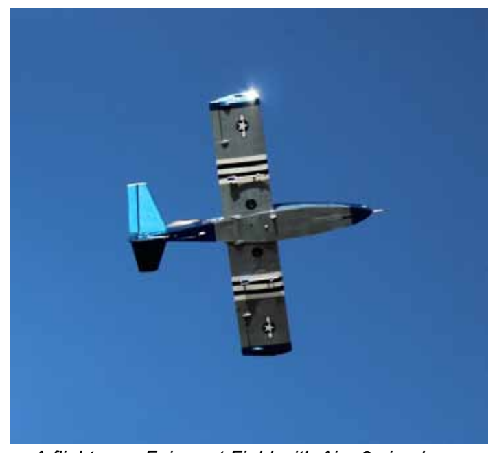
A flight over Fairmont Field with Aim-9s in place.