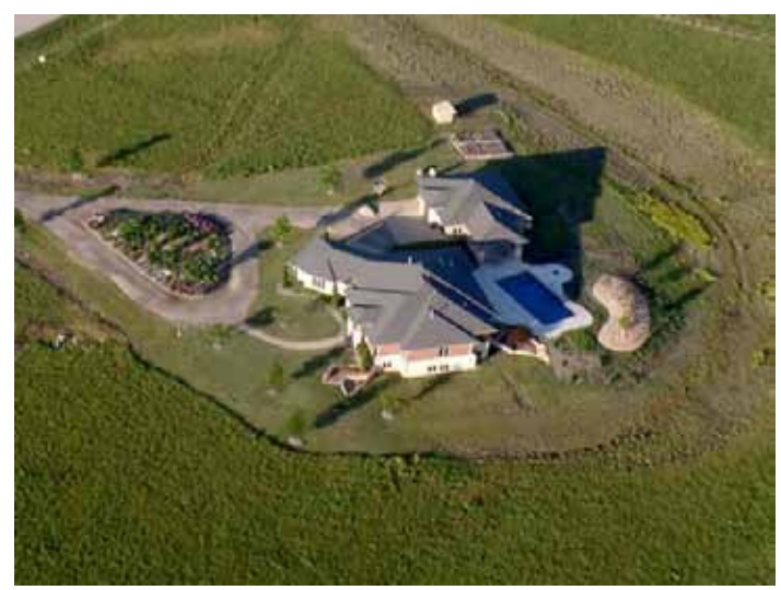
Mission destination; photographing a friend's home. Zoomed and cropped photo from 1000' AGL