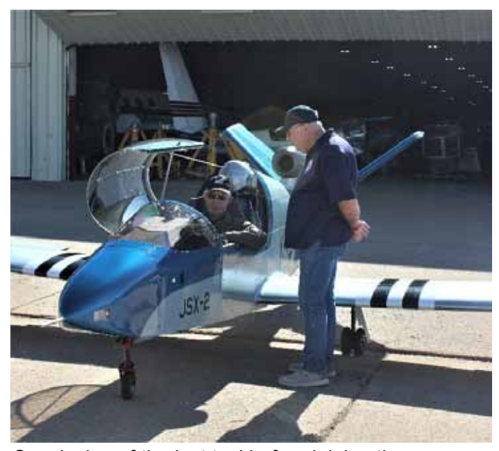
Conclusion of the last taxi before joining the museum.