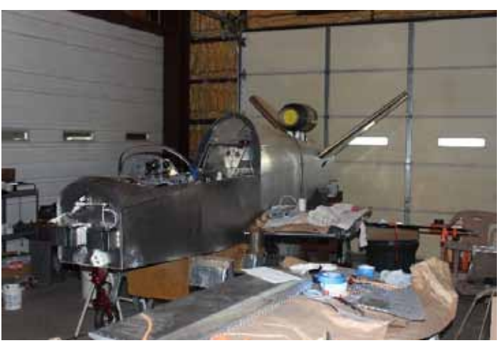
The build process slowly progressing.