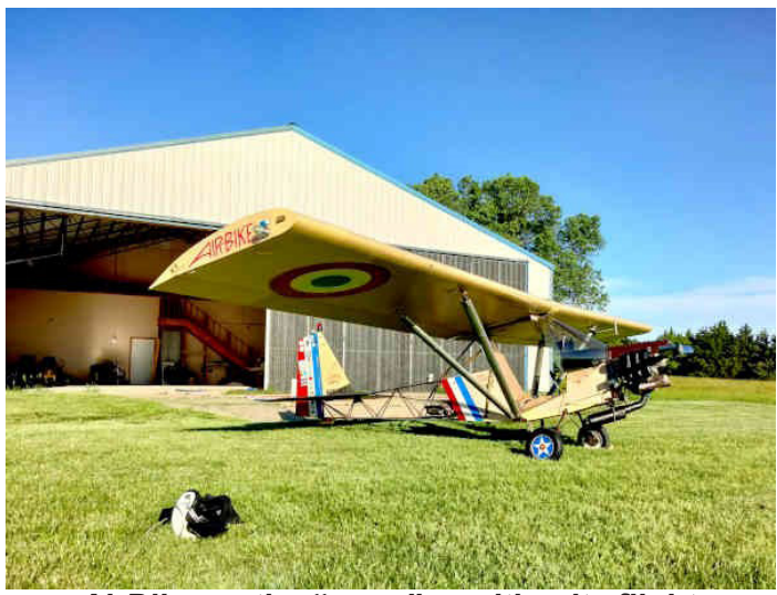
AirBike on the "ramp" awaiting its flight.

The next week's prediction is for five days of rain. Go fly whenever you can! Enjoy the photos, imagine the aroma, engine noise, and vibration. Both were apparent although at different altitudes on the AirBike or the Honda 650 motorcycle. Life is good!