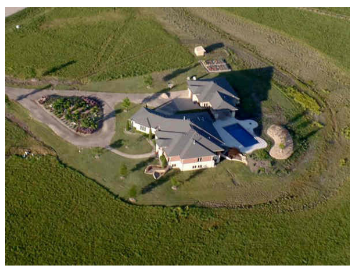
Mission destination; photographing a friend's home. Zoomed and cropped photo from 1000' AĠĹ