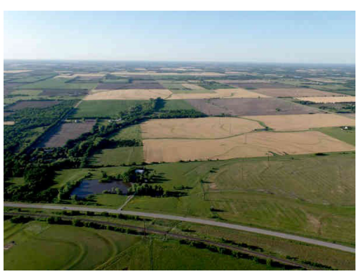
I just can't seem to get enough of the beautiful Kansas panoramic view at 1000' AGL.