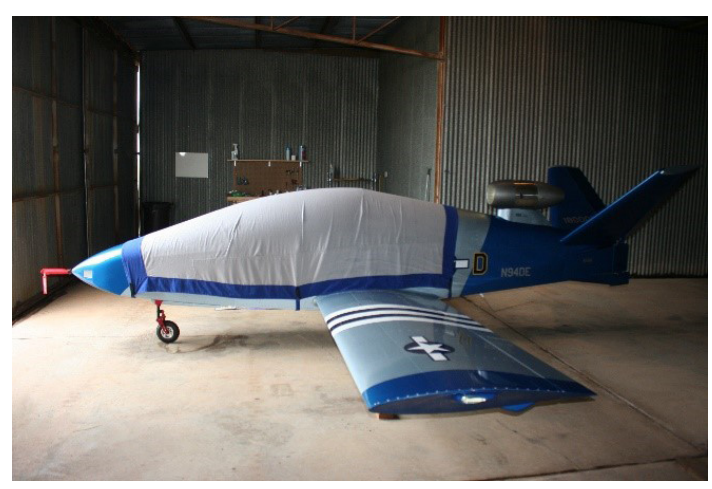
Custom canopy cover and pitot cover sewed by wife Dee Ann.