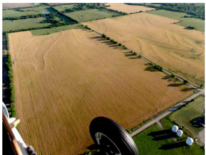
Wheat crops are thick and weed free, a beautiful sight!