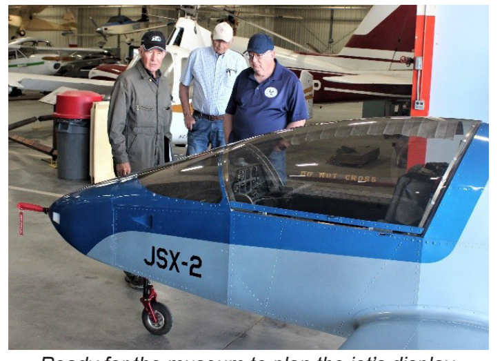
Ready for the museum to plan the jet's display.