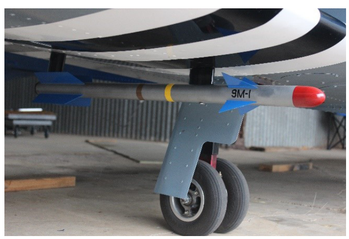
Aim-9 missiles hand crafted to scale and attached to the underside of the wings.

The addition of the auto pilot made flying the jet a lot less labor intensive. The aircraft is extremely responsive so that any little control surface input gave relatively large changes in attitude and having the auto pilot allowed for a little more relaxed flight.