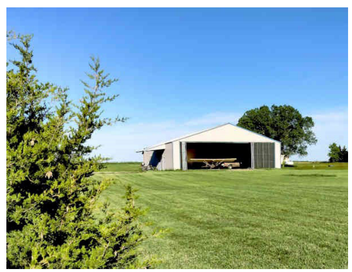
This is the "path" I mowed on which the AirBike will taxi to the runway.