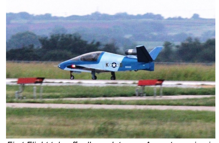
First Flight takeoff roll was late one August evening in 2018.