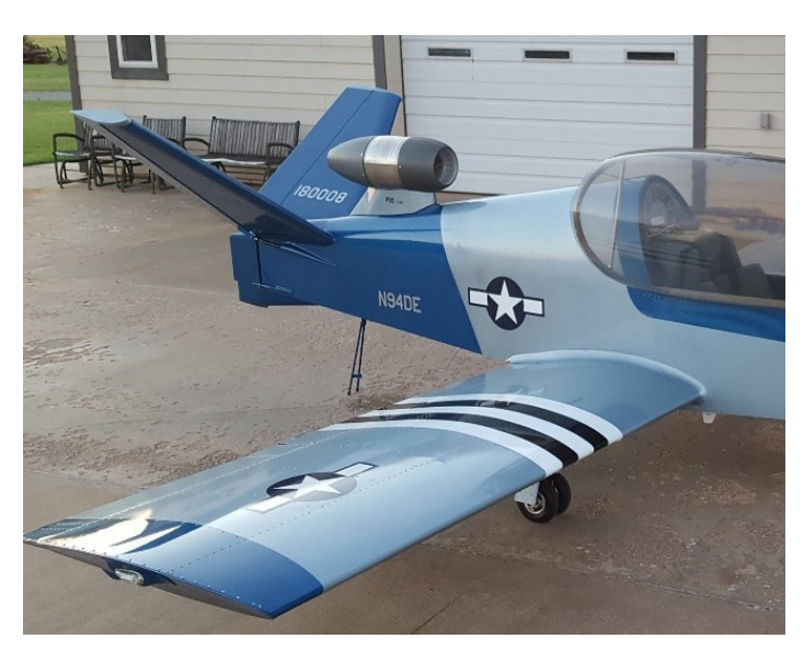
Pneumatic tail stand for parking without the pilot since the plane is tail heavy with the rear engine if the pilot is not seated.