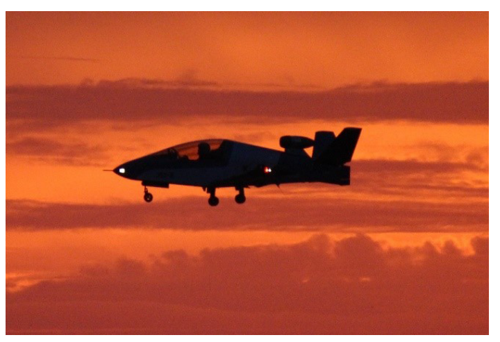
By the time the maiden flight was finished, the sky was lit up by a beautiful sunset. First flight was with gear down for safety consideration.

A few of the personalized additions to the aircraft included Aim-9 missiles, a handcrafted solid walnut control stick, self-designed pneumatic tail stand, hand crafted trim wheel, heated seat, hand crafted air vents and wing fairings, forced air toe heater, oxygen system, exterior charging port, and a Tru-Trak auto pilot.