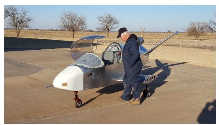
First taxi test was on the driveway at home before installation of the wings.