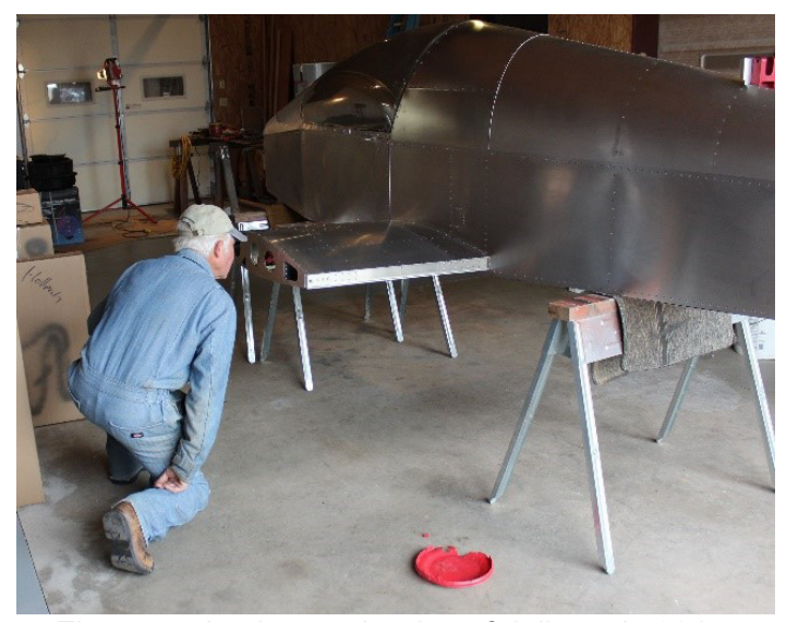
First examination on the day of delivery in 2015.

The museum took possession and title of the aircraft with the understanding that the jet will not be flown again.