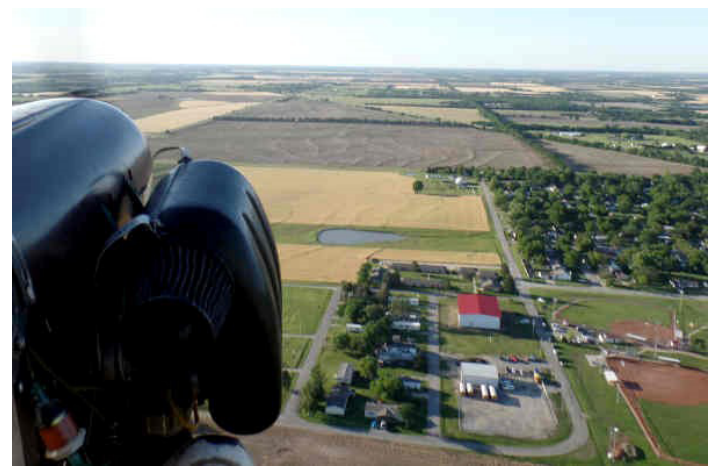
Passing the western edge of Udall, KS.