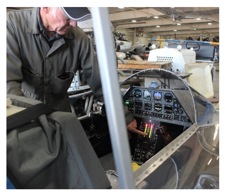
Illustrating the engine monitor.