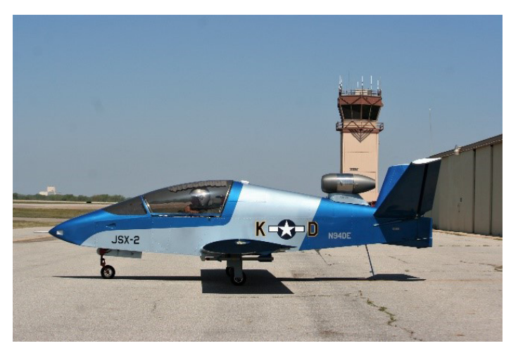
The finished project at Woodring Regional Airport.