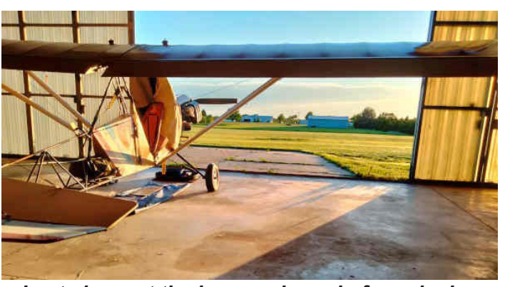
Last view out the hangar doors before closing them. When building this plane in 1998, I never imagined how much it would affect my life---it continues being a fantastic experience! June 2022—page 8