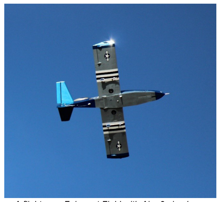
A flight over Fairmont Field with Aim-9s in place.