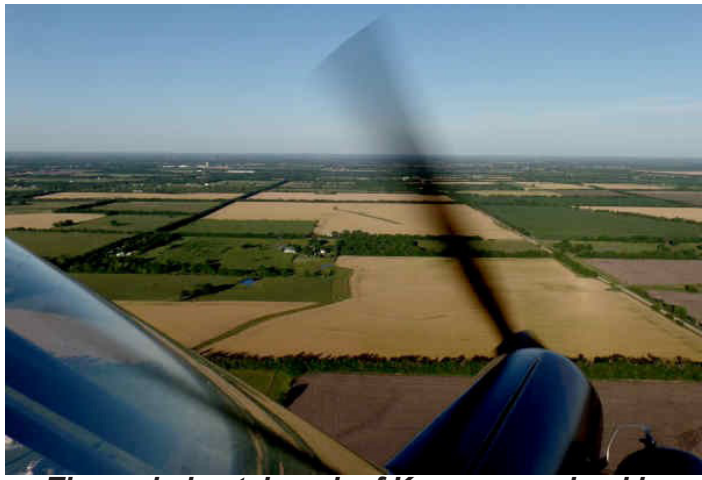
The varied patchwork of Kansas cropland is best viewed in the Springtime.