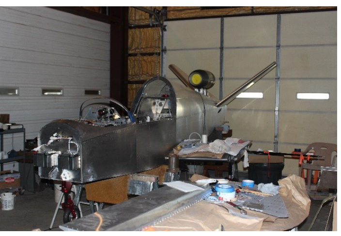
The build process slowly progressing.