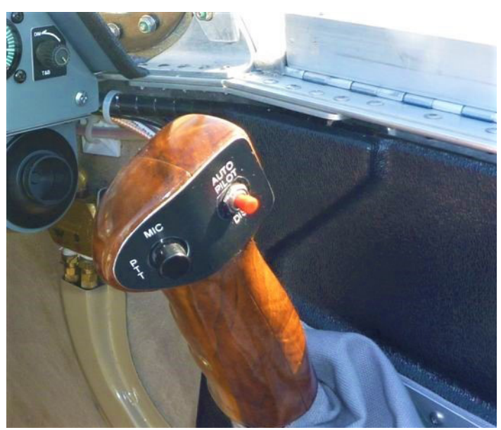
Solid walnut control stick.