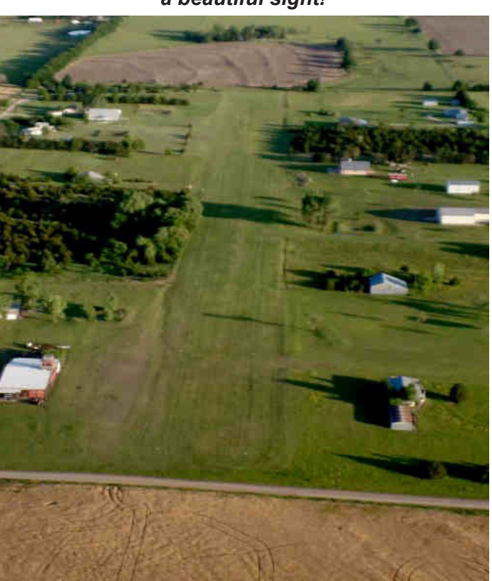
Cherokee Strip (18KS) runway near Udall, KS