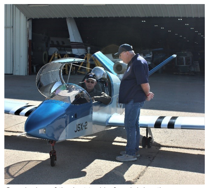
Conclusion of the last taxi before joining the museum.