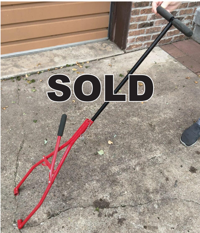
Like new tow bar with collapsible handle for nosewheel airplane, was used on a Piper Comanche. $50.00

(The owner sold his airplane a year ago. The buyer didn't want the electric tow bar. )