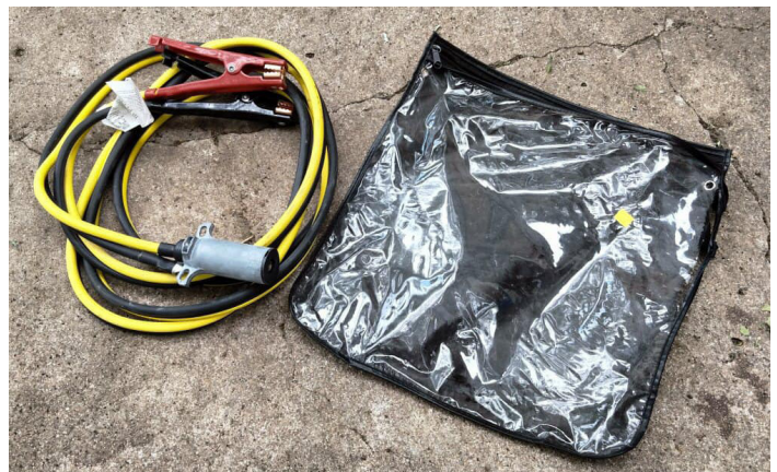
Like new jumper cables, used on Piper Comanche. $50.00.