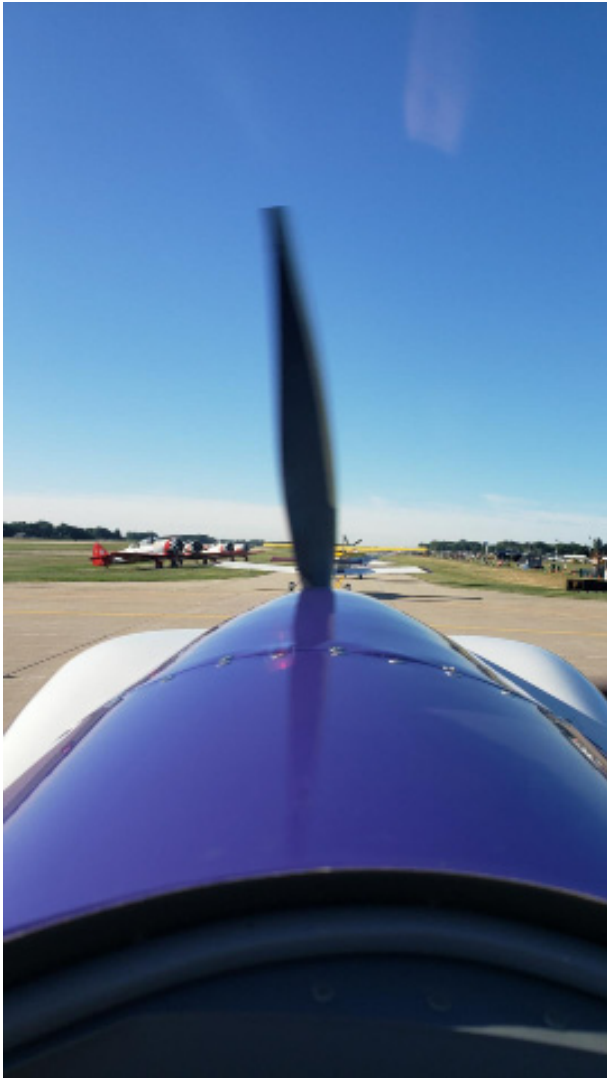
Lined up, ready to depart...