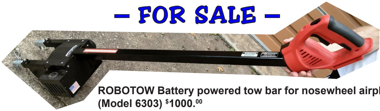
ROBOTOW Battery powered tow bar for nosewheel airplane. (Model 6303) $1000.00

See details https://www.robotow.com/products/28VL-Cordless-Universal-Robotow-Recommended-p239005002