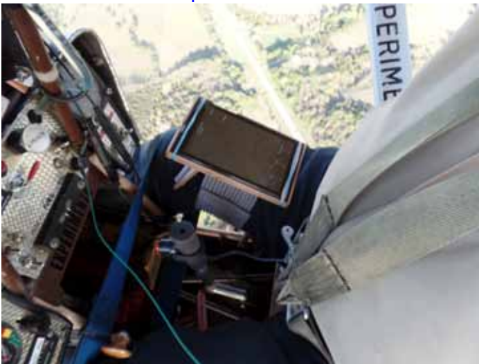
Kneeboard is conveniently located and easy to use while in flight.