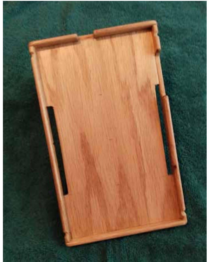
Kneeboard base and angled leg are made from 1/4" plywood, sides are made from thin hardboard. Note cutouts to access tablet controls and slots for elastic band.

A couple hours in the shop and you too can make a similar kneeboard to accommodate your tablet and the downloaded Avare software. Make the kneeboard to suit your tablet and leg size.