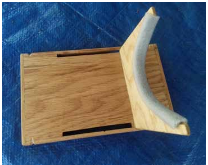
Kneeboard cushionin---Backer Rod (dowel-shaped insulation) has been slotted and glued to the knee cutout to cushion the leg fit.