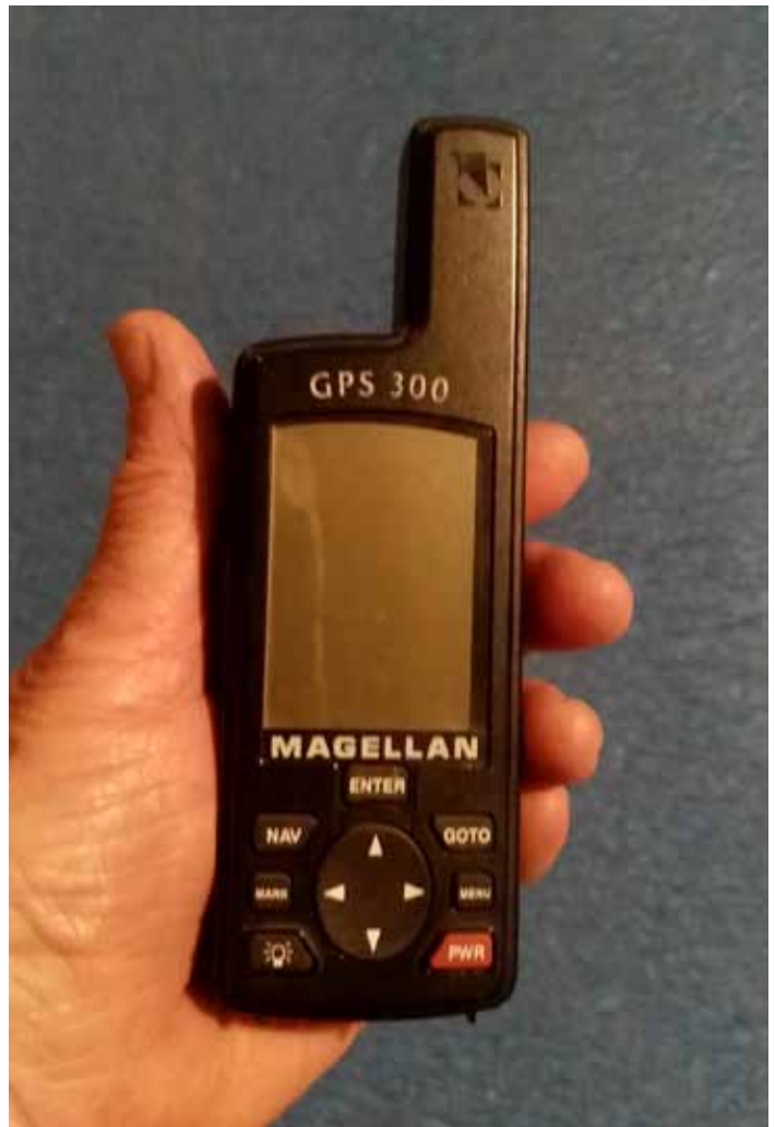
The Magellen 300 GPS has now been replaced by the tablet.