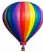
Hot Air Balloon Rides

Sponsored by: The Kearny County Chamber of Commerce Car Show - Vendors - Fun Run