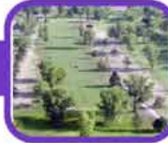
Golf Scramble Loucks Park Municipal Golf Course