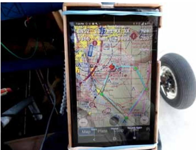
Completed flight path---The 5" x 7" tablet display is very readable, it can also be zoomed.