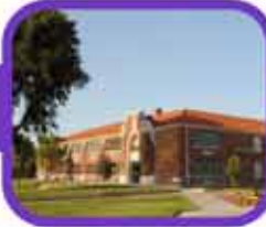
Lakin Alumni Association Banquet