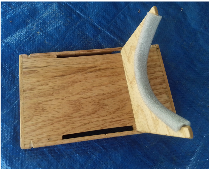
Kneeboard cushionin---Backer Rod (dowel-shaped insulation) has been slotted and glued to the knee cutout to cushion the leg fit.