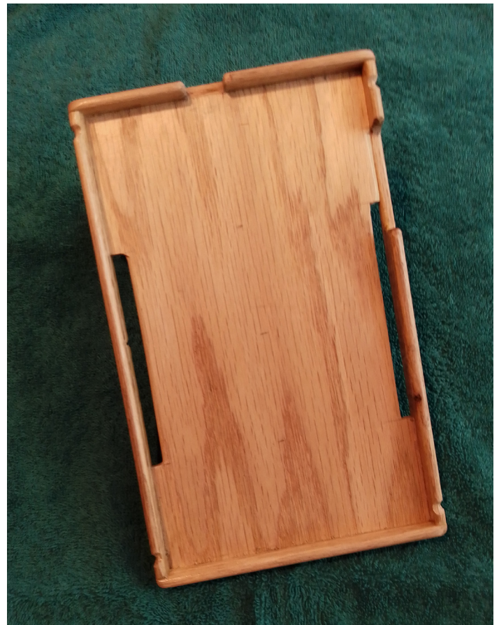
Kneeboard base and angled leg are made from 1/4" plywood, sides are made from thin hardboard. Note cutouts to access tablet controls and slots for elastic band.

A couple hours in the shop and you too can make a similar kneeboard to accommodate your tablet and the downloaded Avare software. Make the kneeboard to suit your tablet and leg size.