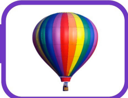
Hot Air Balloon Rides