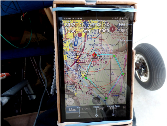
Completed flight path---The 5" x 7" tablet display is very readable, it can also be zoomed.