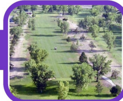
Golf Scramble Loucks Park Municipal Golf Course