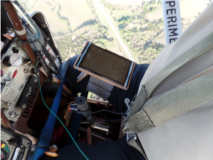
Kneeboard is conveniently located and easy to use while in flight.