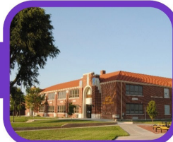
Lakin Alumni Association Banquet