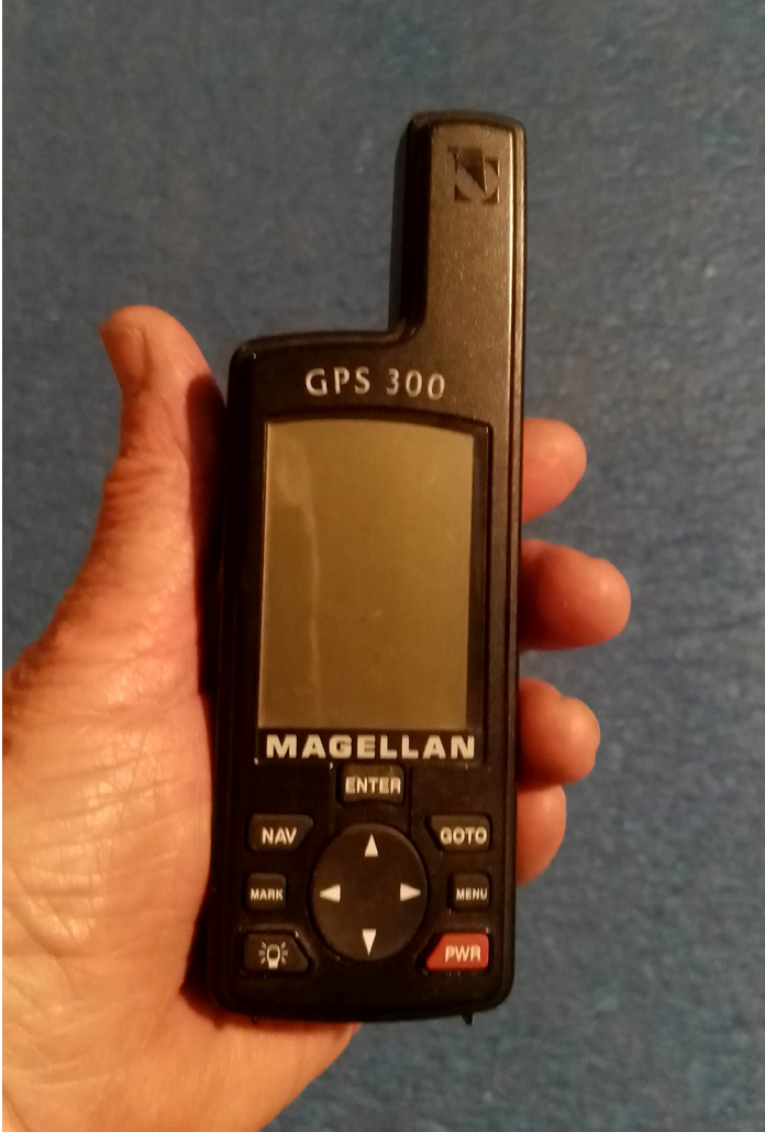
The Magellen 300 GPS has now been replaced by the tablet.