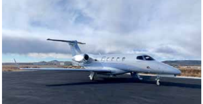
TODD CRIST recently got a new type rating in the Embraer Phenom 300.