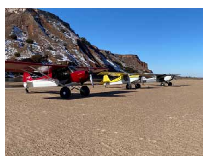
A trip down into Oklahoma to the salt plant and Cimarron River down by Freedom.