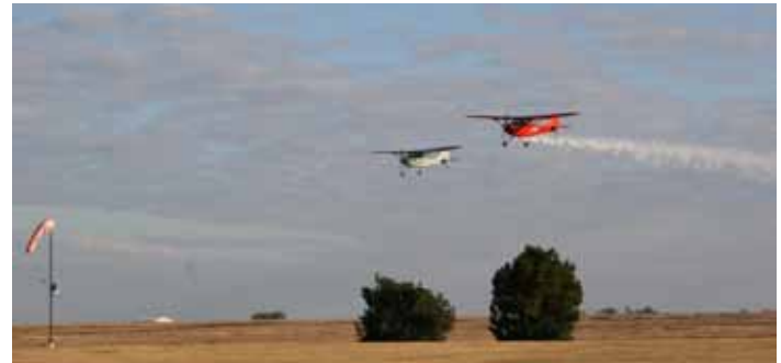
January 2021—page 4