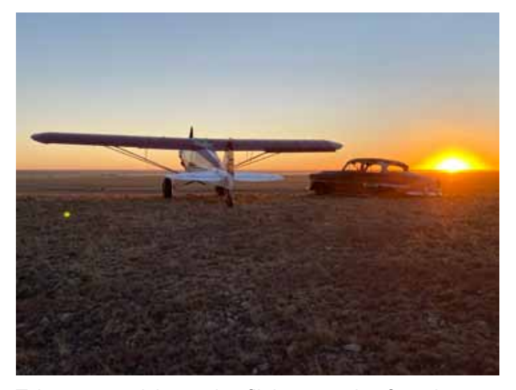
Taken on a quick evening flight a couple of weeks ago. Near Ravana Cemetary on the west side of Finney County lake.