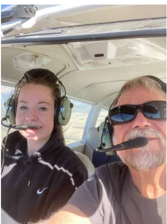
August 2021—page 7