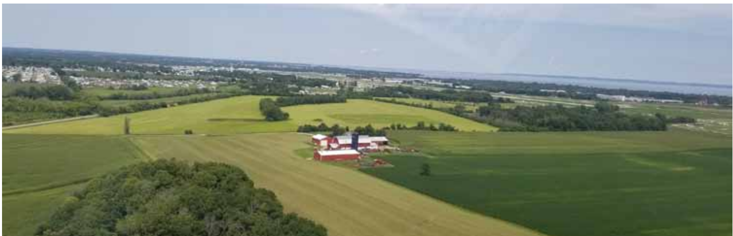
August 2021—page 5