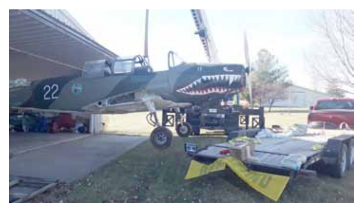
The crane operator moved PT-26 Safely off the trailer & into the hangar as the weather began to change.