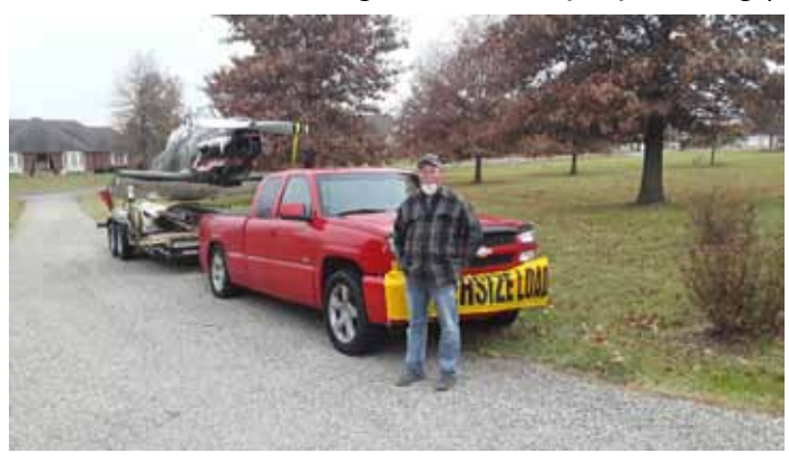
Travel day was Nov 21 and arrival home about 9 pm. Long day and we "burned" a lot of gas with this OVERSIZE Load.

(600 miles with NO Oil for lubricant may have added some "wear" on engine with the prop turning!)