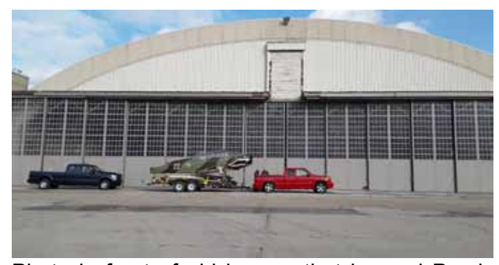
Photo in front of old hangar that housed Presidential Aircraft until moving into new Museum Building 4.