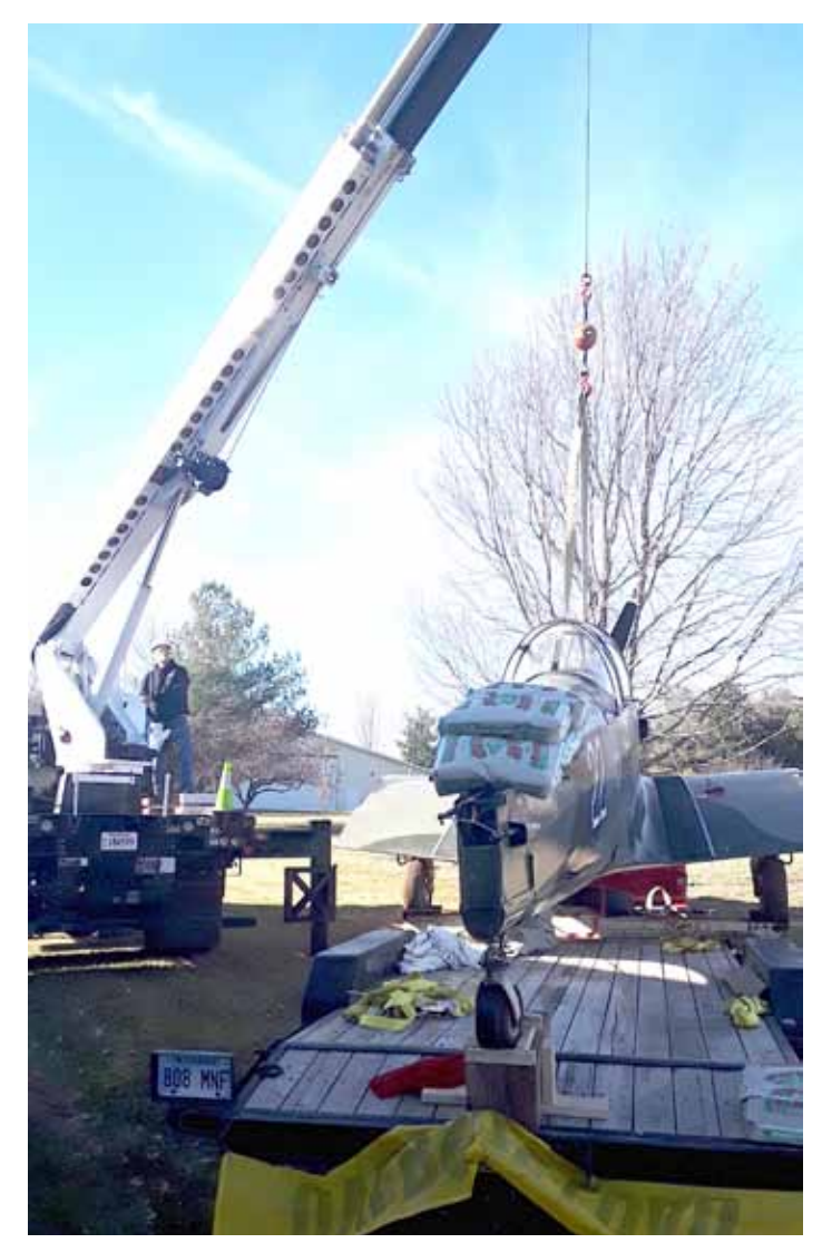
A large crane makes short work and a Safe Offload! After adding five 60 pound bags of sand (the stabilizing "trick" folks at USAF Museum showed me ... IT WORKED!) and offload was smooth.