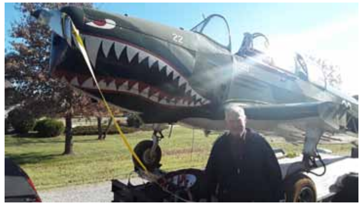
PT-26 fluids had all been drained off in July 1984 when it was flown to Wright-patterson & USAF Museum from the donor's home in Boston, MA. After loading the PT-26 at the Museum, a short drive back to motel showed us the propeller "TURNED in the WIND!"