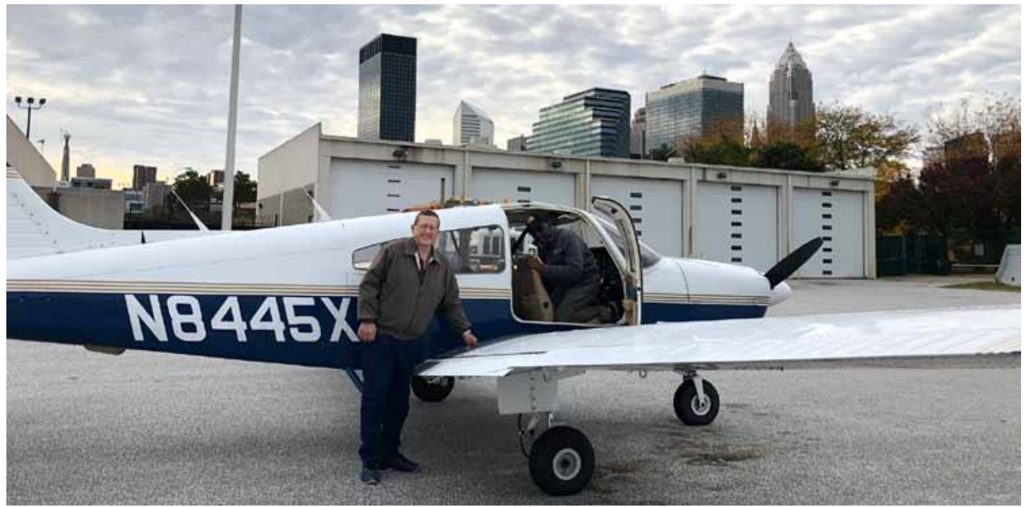
"Kindness can transform soneone's dark moment with a blaze of light. You'll never know how much your caring matters." —Amy Leigh Mercree