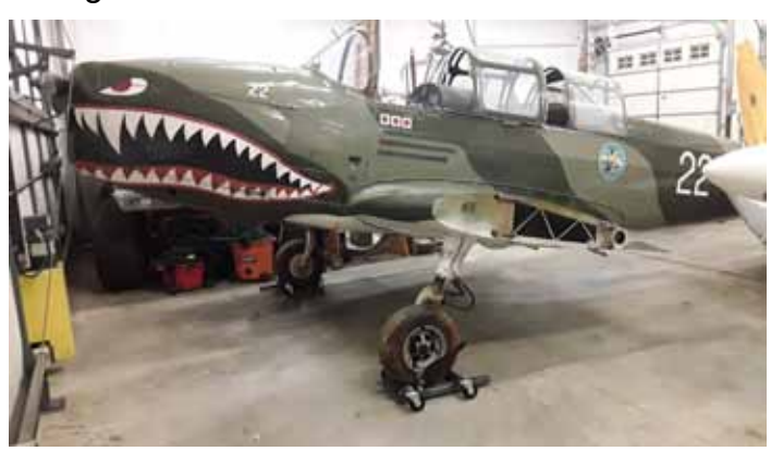
PT-26 inside with wings on roll around. Nose of NORMAN BEUHLER built Thorp T-18 at right of photo.

The PT26 project got offloaded smoothly on November 26, 2019 and rolled into the hangar. Wings are on a separate rollaround.