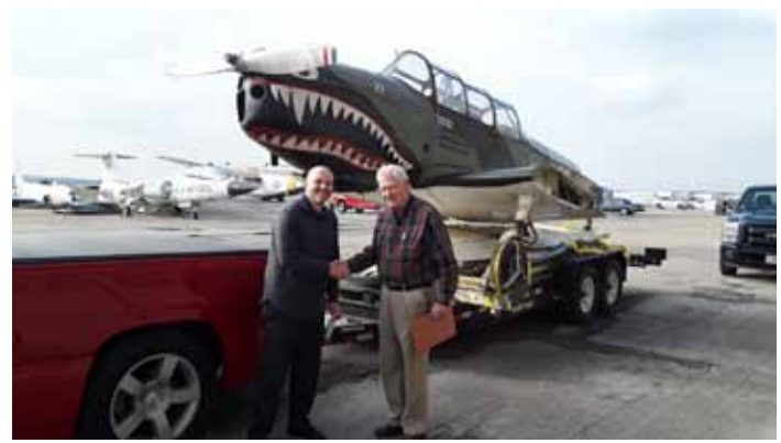
USAF Museum Project Manager signs "exchange" documents plus Bill of Sale (FAA form)