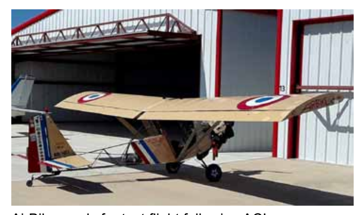
AirBike ready for test flight following ACI.