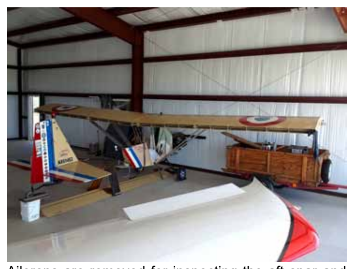
Ailerons are removed for inspecting the aft spar and lubricating the aileron pivot points.