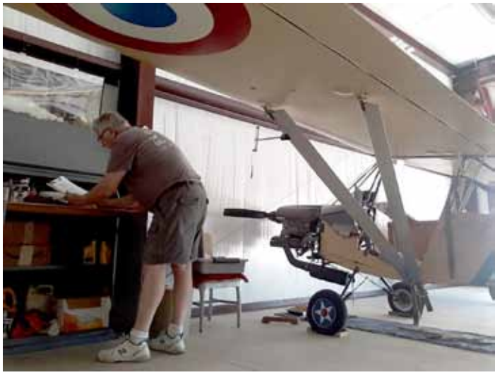
A check list for doing the Annual Condition Inspection is vital for ensuring every aspect of the plane's condition is addressed.

The ACI takes anywhere from 10 to 20 hours to complete over the course of a week or so. I rarely work more than three hours at a time, this is due to my physical endurance (I am 75 years old) and sometimes the heat. I shoot for doing the ACI in June, a month of usually, but not always, benign weather in Kansas. Once everything is completed I have confidence the plane will meet its mission requirements of patrolling the Eastern Front looking for Huns and protecting women and children from harm. This IS a WWI wannabe French fighter! One needs not only have piloting skill but a great imagination!