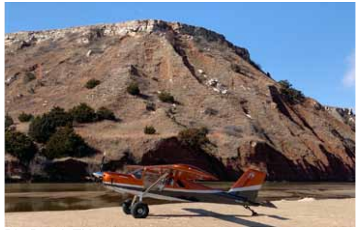
Big Bend, TX

I'm a little late with my birth announcement for 915BS becoming an airplane on Jan 8th, 2020. It's the latest kit out of Rans Aircraft called the S21 Outbound. The reason I went with this model is because it's a really great mix of being fast enough to get somewhere, and slow enough to get into the short areas (no runway needed). I put the new Rotax 915 engine on it which produces 141hp all the way up to 15,000. It cruises at 135mph down low on the 26" Alaskan Bush Wheels and 145mph at 13,500, while burning 7.2 gph. Not bad for a STOL airplane! I equipped the panel with a Garmin G3x touch, a Garmin 175, with both tied to a Garmin autopilot. As of June 1 I've got a little over 160hrs on it with trips to SoCal, Big Bend TX, and all over the State. REALLY enjoying it so far!