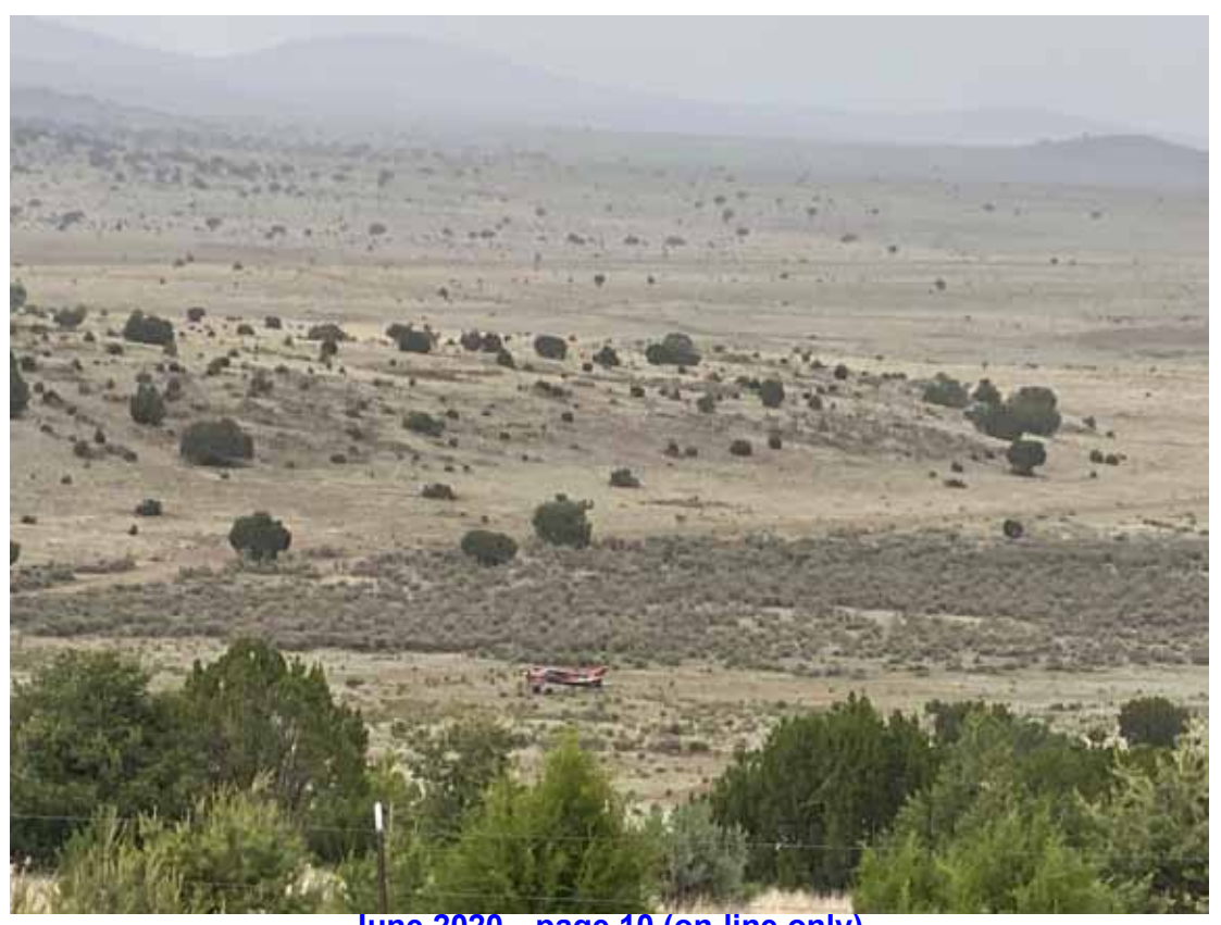
June 2020—page 10 (on-line only)