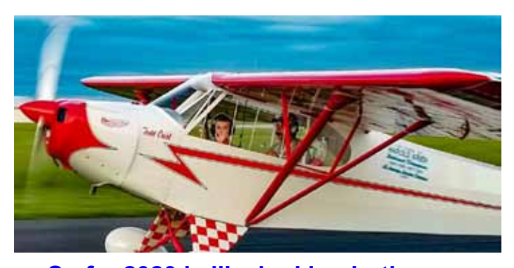
So far 2020 is like looking both ways before crossing the street, and then getting hit by an airplane.