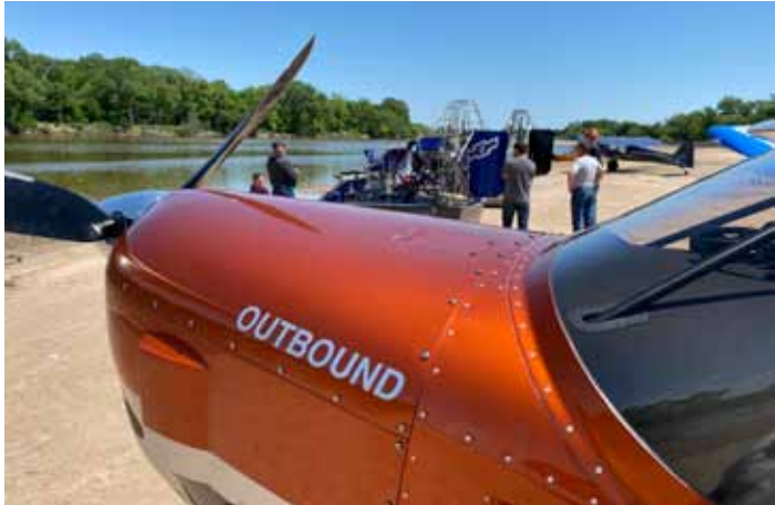
June 2020—page 7