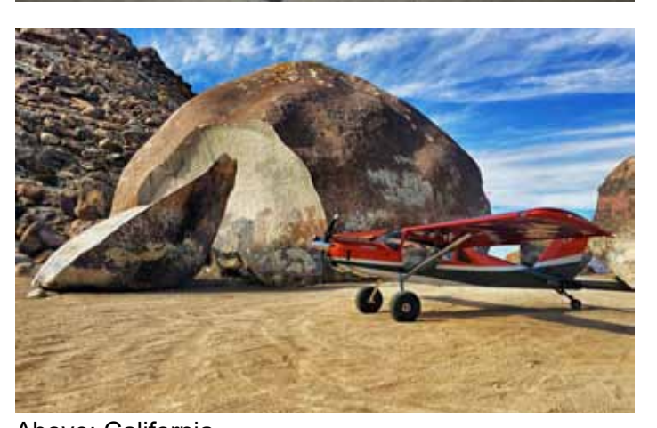
Above: California. Below left and right: Some fellows out of Wichita running air boats.