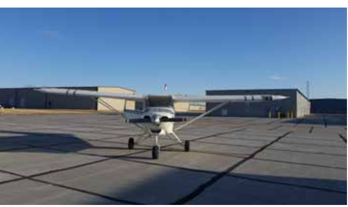
July 2020—page 8 (on-line only)