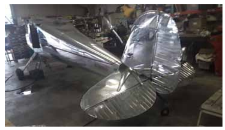
Most of the polishing has been done, using a product called "Nuvite Aluminum Polish"