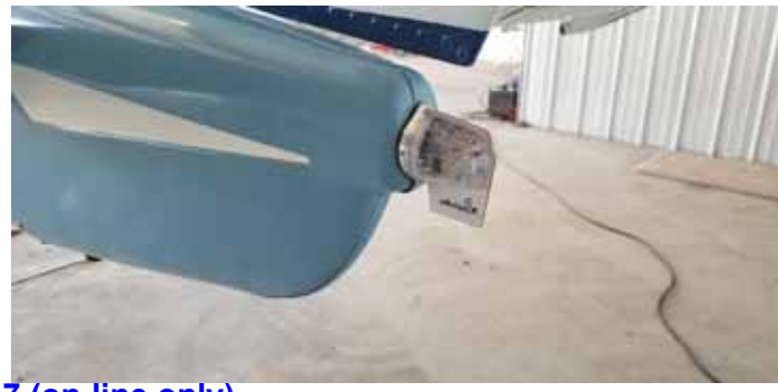
July 2020—page 7 (on-line only)