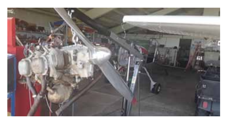
Cont'l 85 is pretty dirty.