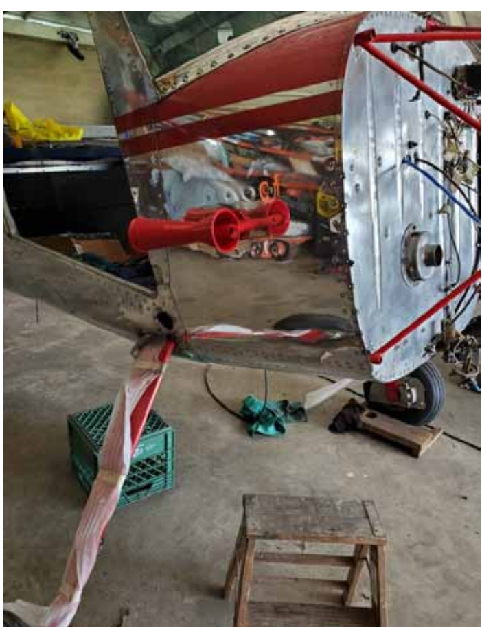
Engine Mount, too. (Who will ever see that?)