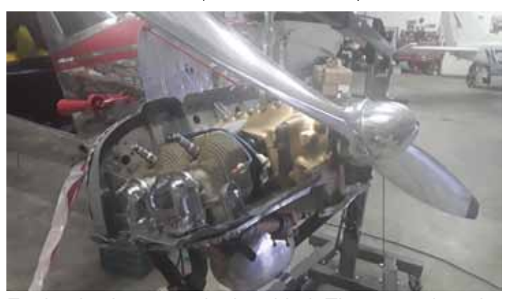
Engine is cleaner, paint is added. Then, metal on the air baffeling needed to be shined a bit ... with this result. Still need new fabric on the wings, but, some progress.