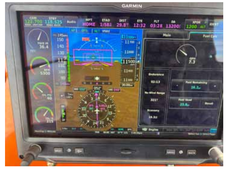
FROM BRIAN SHIRLEY —Came home from NM 6/15. Pretty impressive numbers for a STOL type airplane. 145TAS all the way home, 7.3 gph. (Read about Brian's Rans S21 Outbound in June's FLY PAPER)