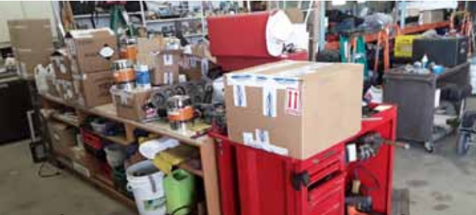
Lots of boxes to hold the supplies needed for doing the wings...