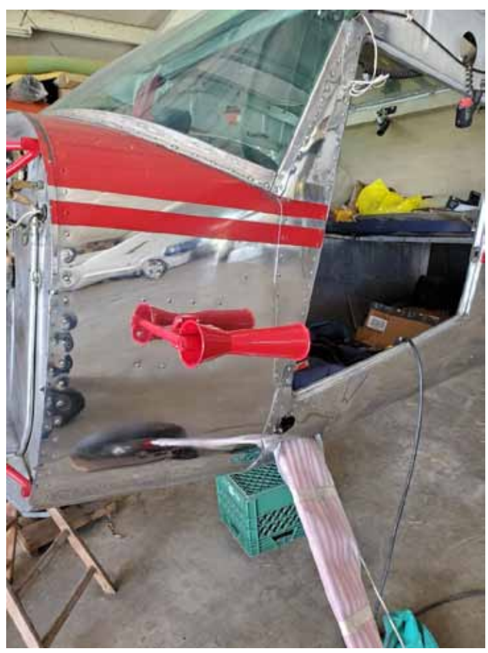
Powder Coated Gear, Struts & venturi, etc