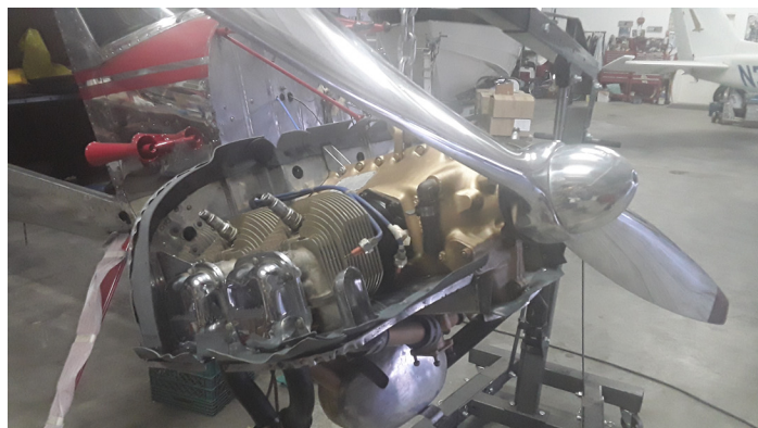
Engine is cleaner, paint is added. Then, metal on the air baffling needed to be shined a bit ... with this result. Still need new fabric on the wings, but, some progress.