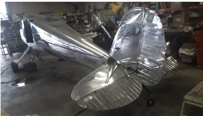
Most of the polishing has been done, using a product called "Nuvite Aluminum Polish"