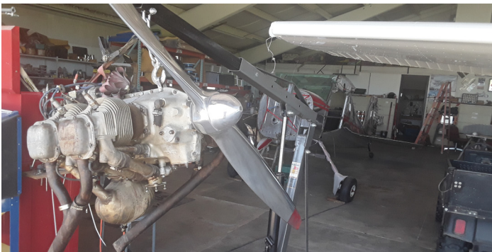
Cont'l 85 is pretty dirty.