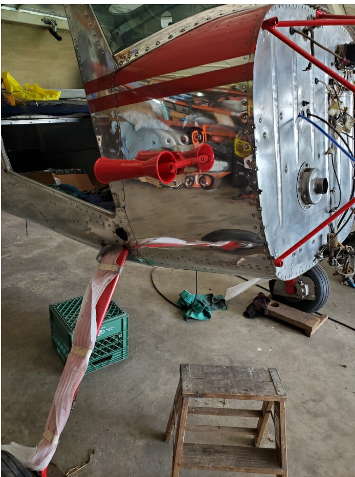
Engine Mount, too. (Who will ever see that?)