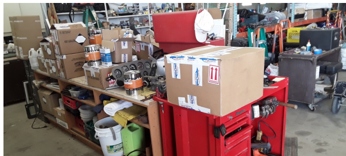
Lots of boxes to hold the supplies needed for doing the wings...