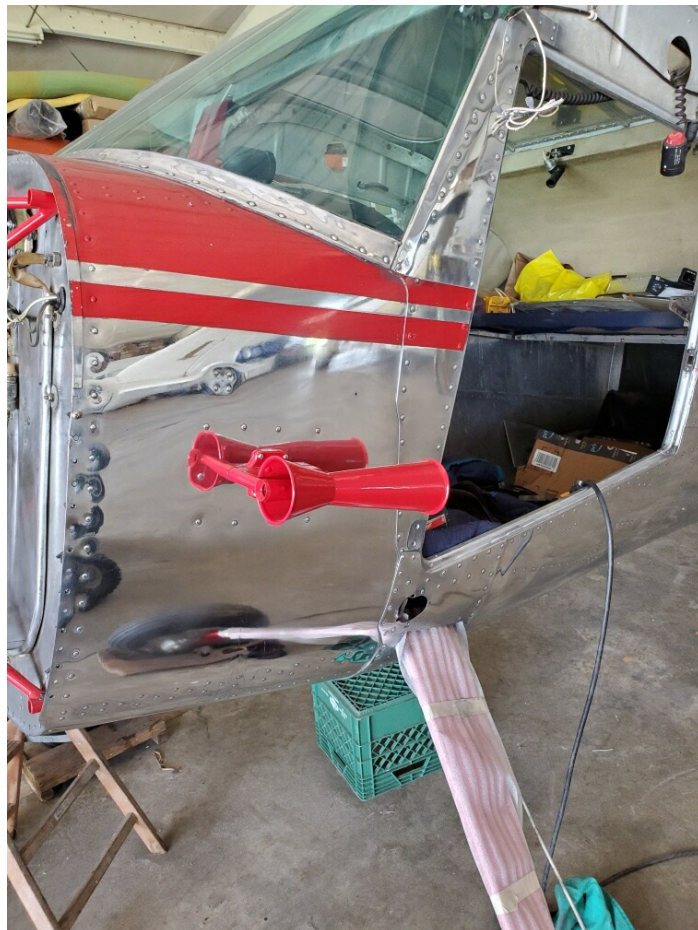
Powder Coated Gear, Struts & venturi, etc