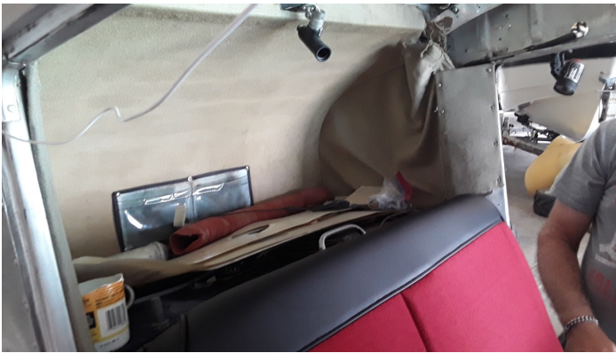
Seats recovered and in place. Interior, door panels, etc to go, including this "hat rack" that's not found in current models.