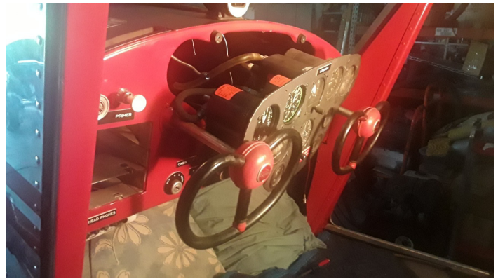
Reinstall instrument panel with a few reconditioned/tagged instruments.