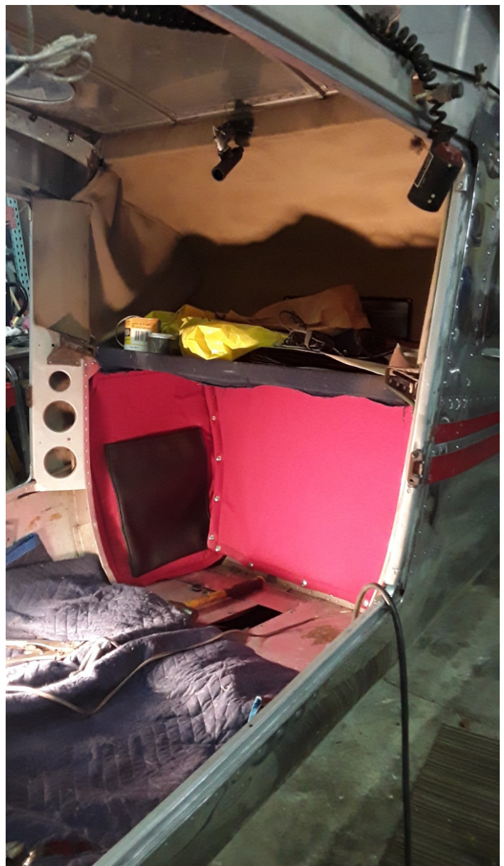
Another interior photo, with seat removed to access space below the unfinished "hat rack" but, a new, red, silencing pad reinstalled just in front of battery and it's box.