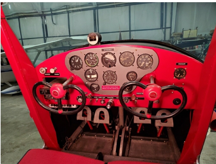
I may have used a "bit more red paint" than "factory new" ever did.