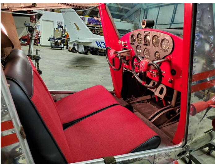
Another view with seats in.