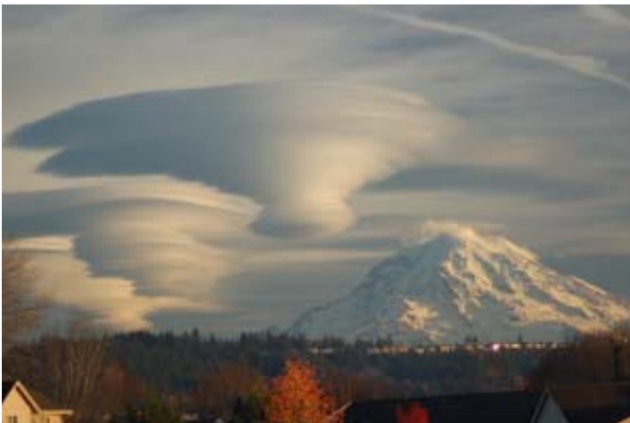
TIM THOMPSON -Lenticular Clouds Above Washington-Credit & Copyright: Explanation: Are those UFOs near that mountain? No -- they are multilayered lenticular clouds. Moist air forced to flow upward around mountain tops can create lenticular clouds. Water droplets condense from moist air cooled below the dew point, and clouds are opaque groups of water droplets. Waves in the air that would normally be seen horizontally can then be seen vertically, by the different levels where clouds form. On some days the city of Seattle, Washington, USA, is treated to an unusual sky show when lenticular clouds form near Mt. Rainier, a large mountain that looms just under 100 kilometers southeast of the city. This image of a spectacular cluster of lenticular clouds was taken last December.