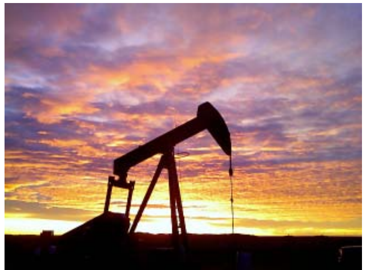
Oil well at Sunset January 13.