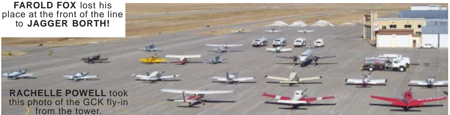
RACHELLE POWELL took this photo of the GCK fly-in from the tower.