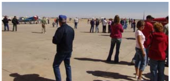
RIGHT: DDC fly-in brought in LOTS of people, airplanes, and red sports cars, too!